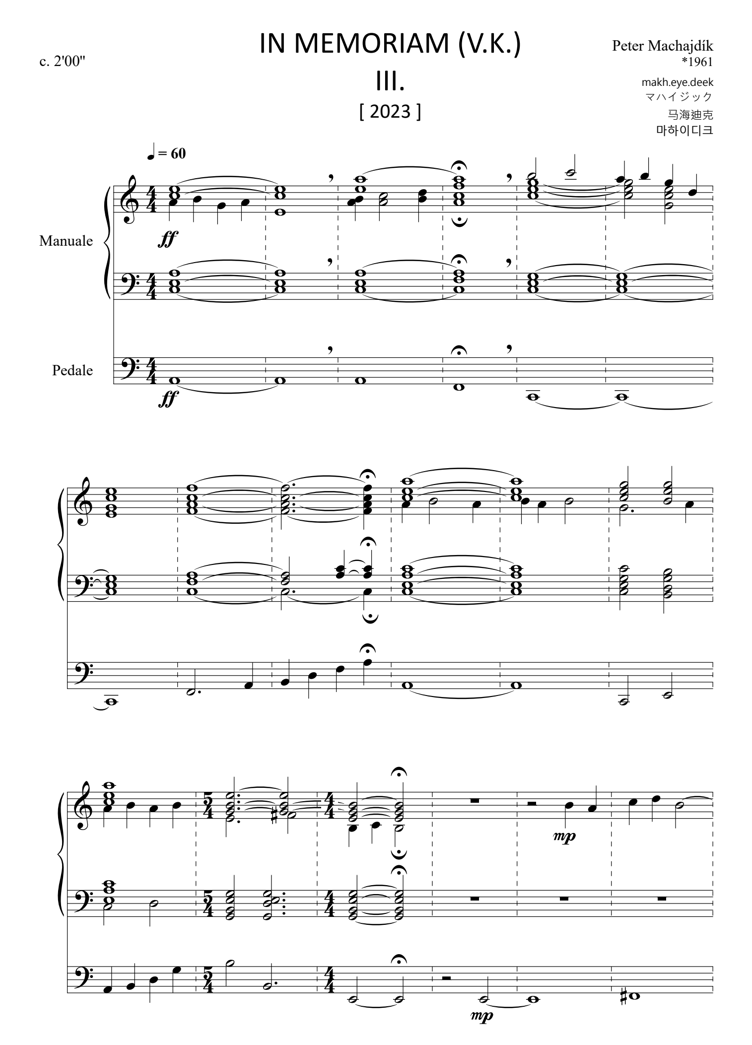
Copyright © 2023 by Peter Machajdík (all rights reserved) GEMA SOZA www.machajdik.com